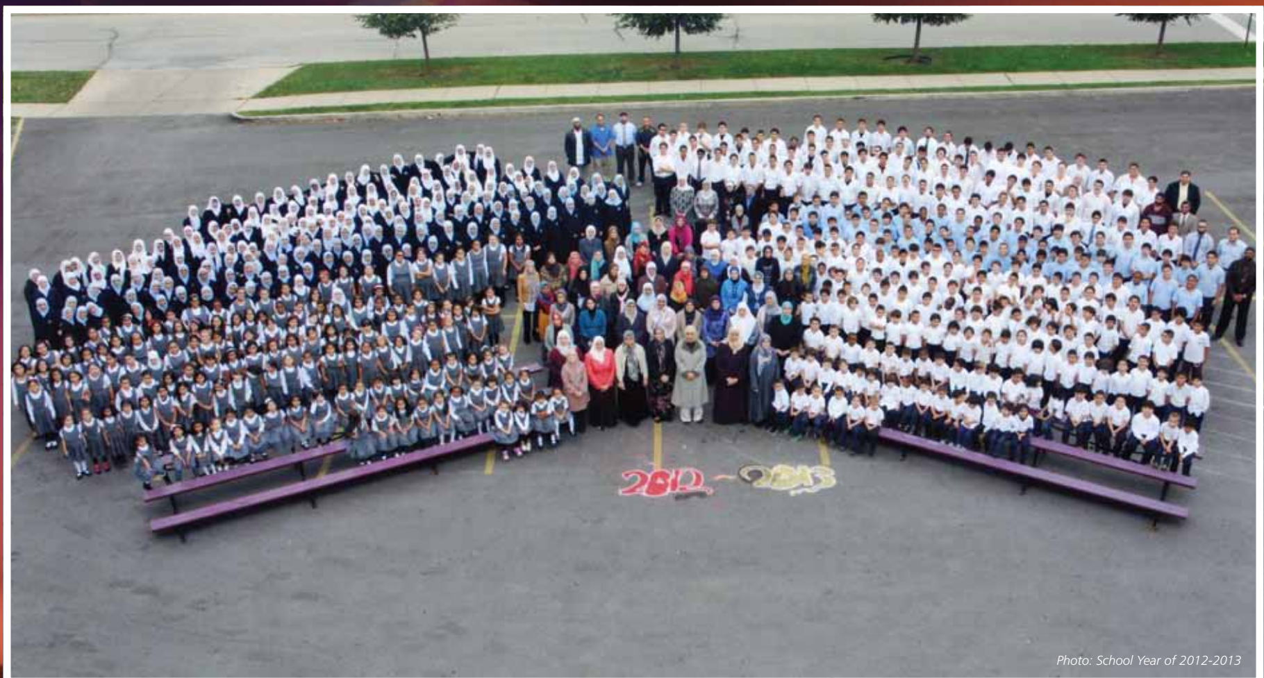
Photo: School Year of 2012-2013